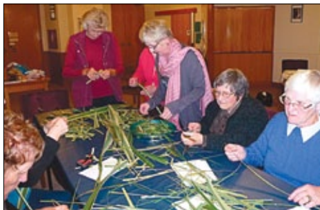
At the April Meeting the Holy Trinity AAW in Gore were busy making palm crosses.