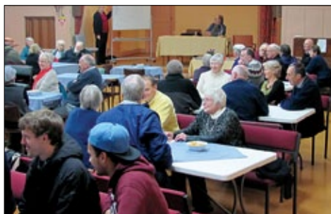
Quiz Night at St John's Dunedin

The mission of a Women's Group is the spiritual formation of women by fostering in them a greater desire to know, love, and serve God. As a community of women rooted in our faith, we offer opportunities to deepen our relationship with God, develop relationships with other women in order to support our spiritual growth, and manifest our love for God by serving God's people.