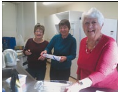
Top left: Prayer shawls