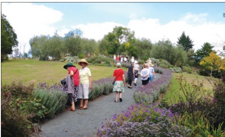
Bottom: Takapuna AAW visit to Woodville